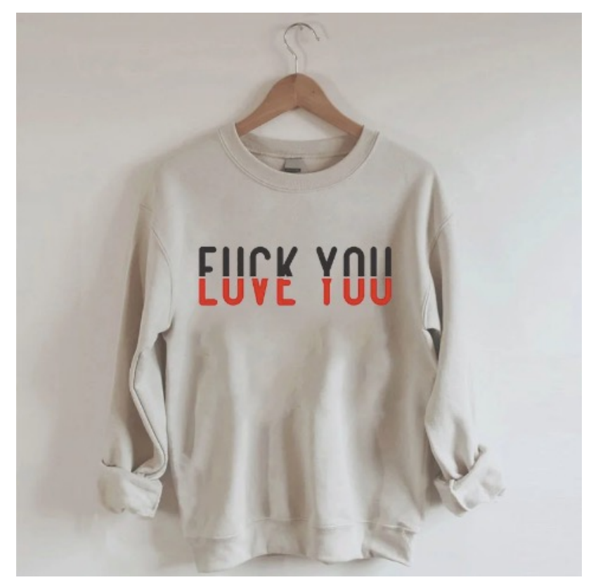
Love You Sweatshirt, size L or XL (Vorsace)