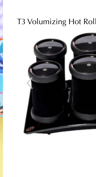
T3 Volumizing Hot Rollers LUXE