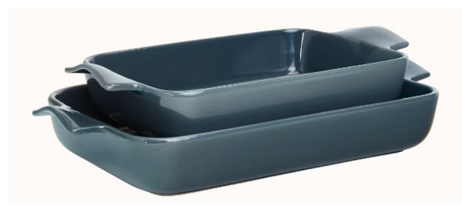
Cravings by Chrissy, Oven-to-Table Ceramic Bakeware Set