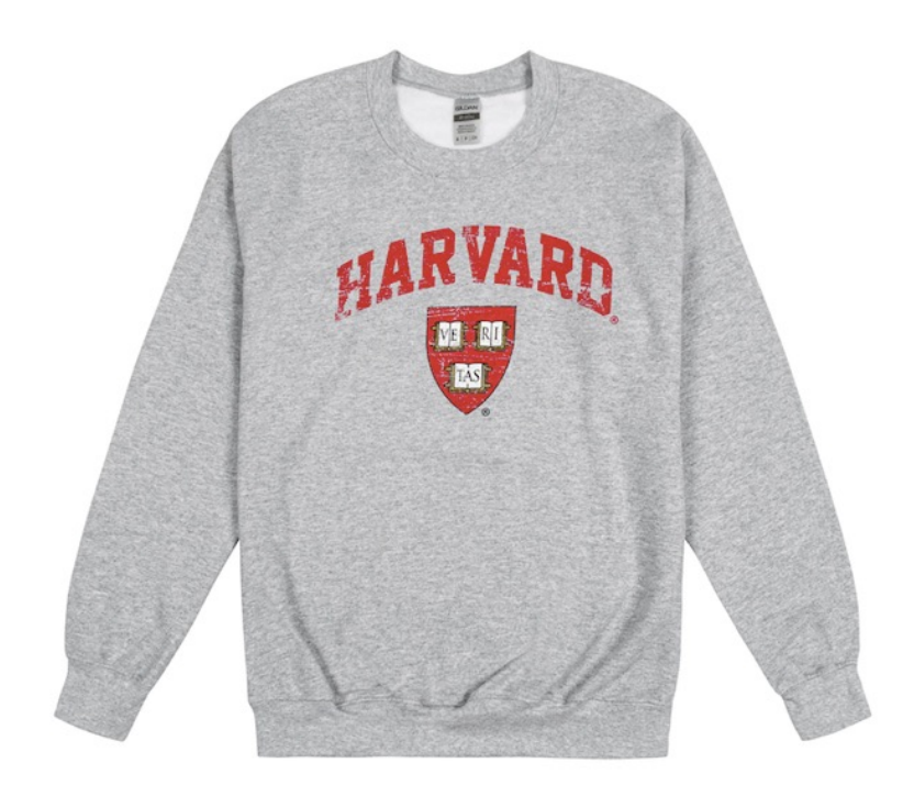
Vintage Crew Sweatshirt, size XL (The Harvard Shop)