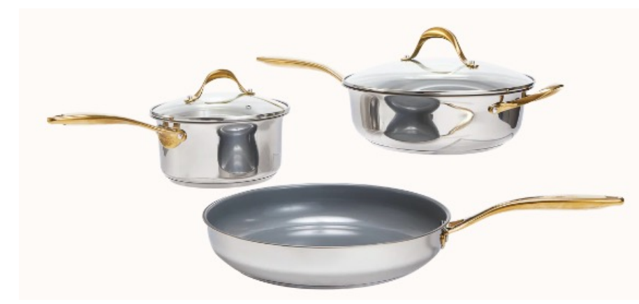
Cravings by Chrissy, Chrissy's Stainless Steel Set

Dokotoo Women's 2023 Winter Long Sleeve Solid Fuzzy Fleece Open Front Hooded Cardigans Jacket Coats Outwear with Pockets, size M (Amazon)