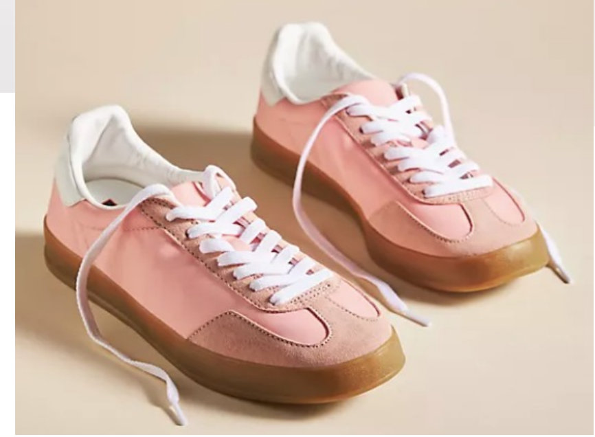
Jeffrey Campbell Keys Sneakers, Pink, size 7