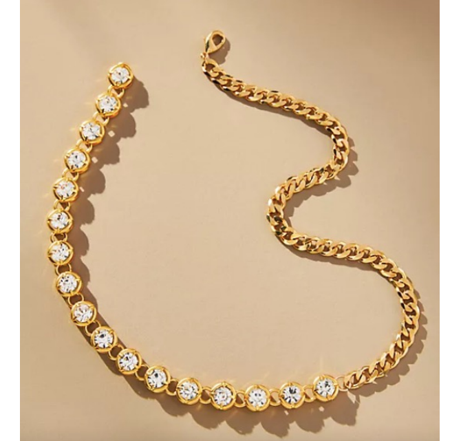
Logan Tay Rhinestone Mix Chain Necklace